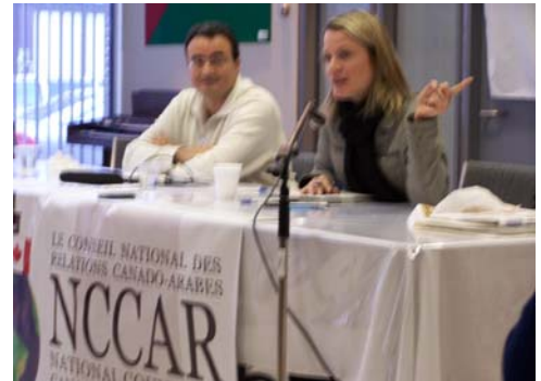
NCCAR regularly meets with local Arab organizations

NCCAR is hoping to achieve several objectives from this partnership with the Ontario Trillium Foundation: first to intro-